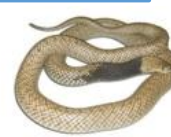
Western Brown Snake