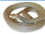
Common Brown Snake