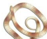
Speckled Brown Snake